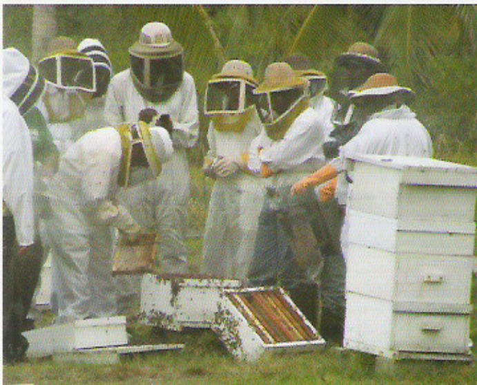
Getting close to Africanised honey bees during the field trip

The Congress attracted beekeepers, researchers, scientists, entrepreneurs, students and local media. During the field visits, three